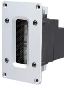
NeoX2.0 ribbon tweeter